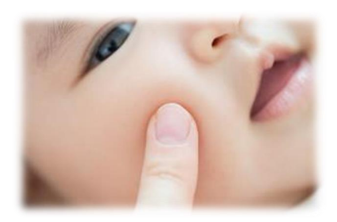
Beautifully glides onto and easily/deeply absorbed into skin