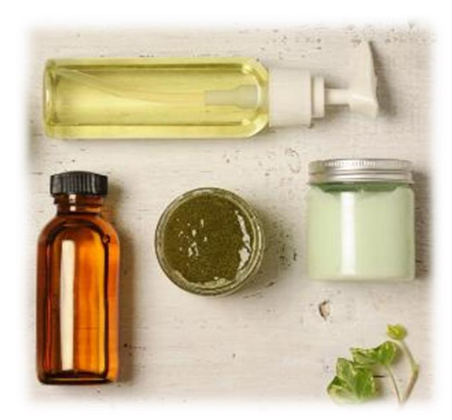
Leaving skin feel as soft and smooth as a baby